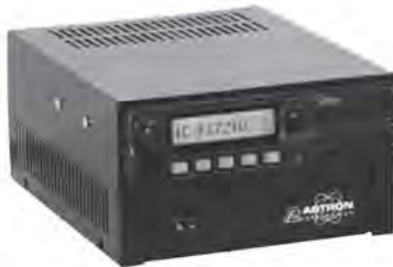
MODEL SS-10F1721 SS-12F1721 SS-18F1721