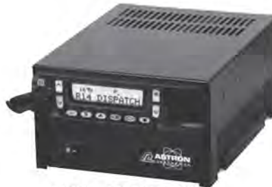
MODEL SS-10TK7180 SS-12TK7180 SS-18TK7180