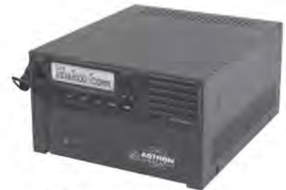
MODEL SS-10TK71/8150 SS-12TK71/8150 SS-18TK71/8150